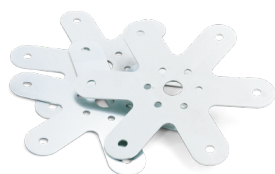
Flexible grinding head spring steel replacement