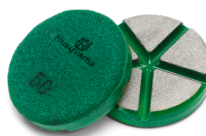
CP 1200 series