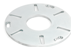
Redi Lock® diamond holder disc