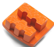
G1410 3 PCS