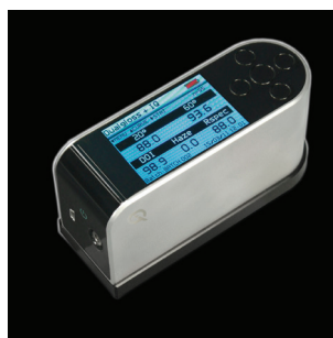
GLOSS & DOI METER RHOPOINT IQ 593 31 15-01