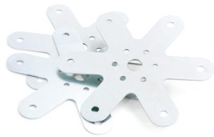
FLEXIBLE GRINDING HEAD SPRINGHARDNESS TEST MOH'S TEST KIT 593 31 69-01