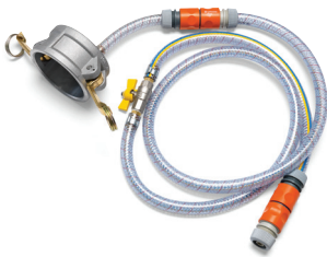
WATER KIT 505 45 32-01