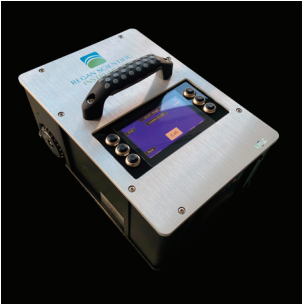
FRICITION TESTER BOT 3000E 531 18 50-01