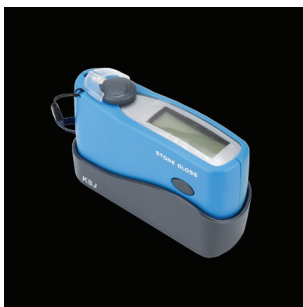
GLOSS METER MG6-SS 593 31 32-01