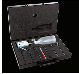
PENETRATION TEST KARSTEN PIPE TEST KIT 598 85 80-02