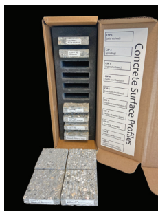
ICRI PROFILE CONCRETE SET 546 21 69-01